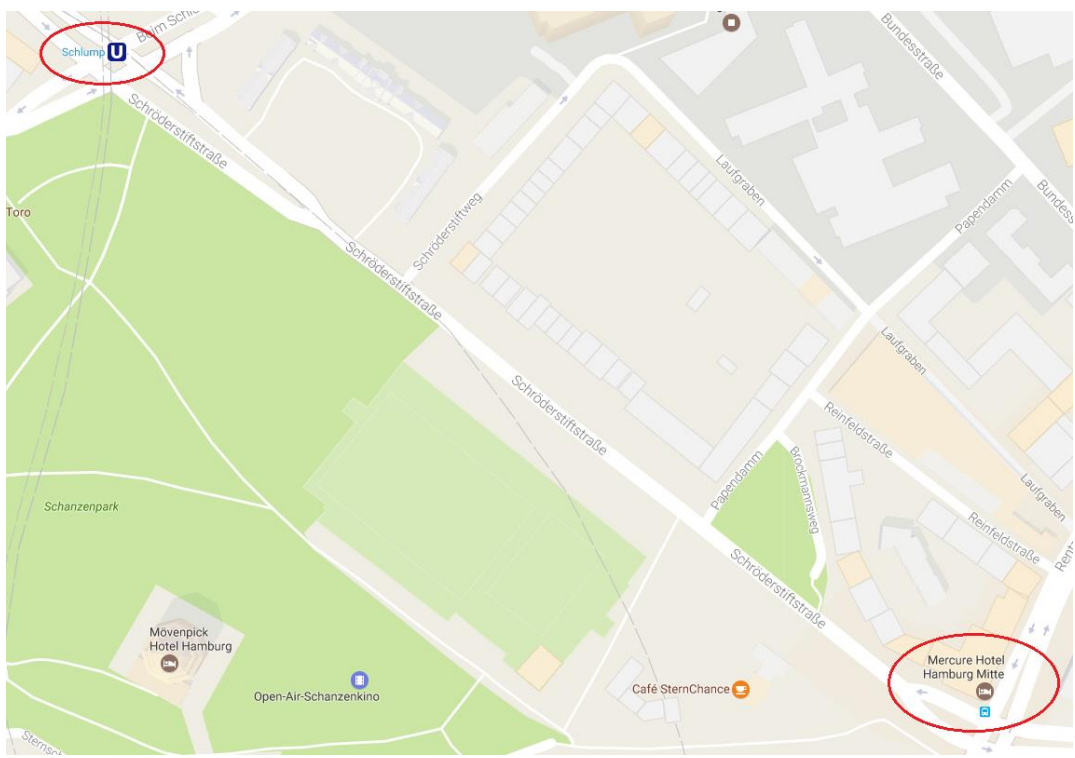
Figure 2 From Schlump to your hotel

The fastest way to reach your hotel from the airport is by urban train (S-Bahn) and subway (U-Bahn). From the airport, you take the S1 (direction: Ohlsdorf). In Ohlsdorf, you change to the subway U1 (direction: Farmsen). Next, you change at Kellinghusenstraße to U3 (direction: Hauptbahnhof Süd). Your destination is Schlump. From Schlump you walk a few minutes along Schröderstiftsstraße to your hotel (see Figure 2).